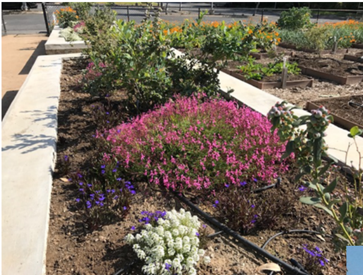
The blueberry bed