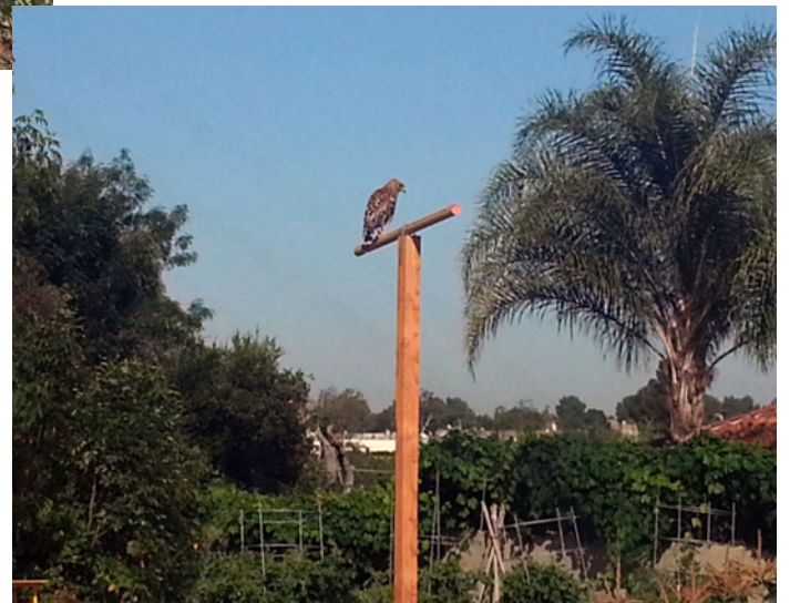
A lovely hawk supervised It all