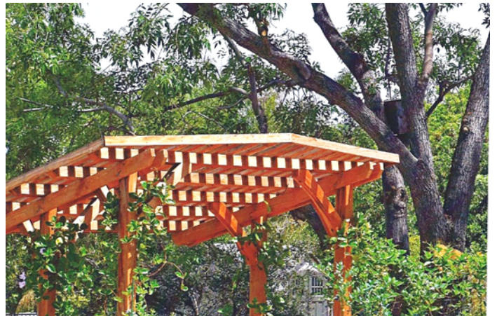
This little arbor covers steps to the St. Frances Garden