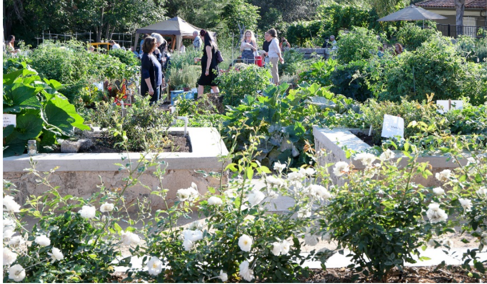
Visitors came to visit