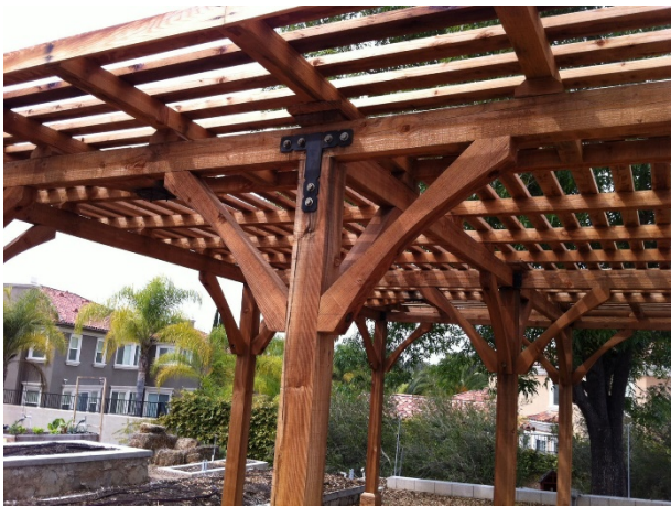
We were impressed with our lovely pergola

With the help and guidance of another parishioner, we built the pergola and the arbor covering the steps down to the St. Francis Garden – a gathering place. On the trellis under the ash tree we planted Giant White Mandevilla to grow over the arbor. This plant came as another blessing from God.